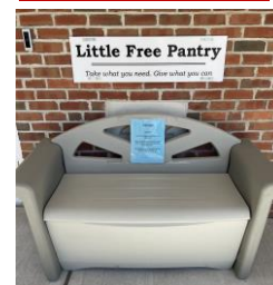
The Little Free Pantry

Please think of stocking canned fruit, canned corn, canned peas, canned carrots, canned black beans, canned kidney beans, rice, canned pasta meals, canned chicken, Spam, canned chili & beans, beef stew, sardines, salmon, canned tomatoes, diced tomatoes, pasta sauce, pasta, toiletries, toilet paper, dish soap, and laundry detergent in the bench.