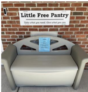
The Little Free Pantry Items Needed!

Strong people stand up for themselves. Stronger people stand up for everyone else.