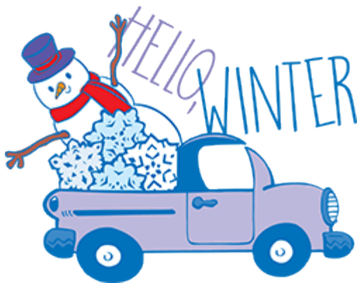
The editor's wishful thinking.

Mercy Center is in need of the following items: chicken soup, ketchup, mustard, mayo, SPAM, canned chicken, juice boxes, juice pouches, 64 oz juice bottles, pasta, oatmeal, pancake mix, syrup, tea, coffee, cooking oil, and wipes. Please place any perishable items in the Fellowship Hall kitchen refrigerator and tell the office that you did. All other items may be left in the bins in the foyer.